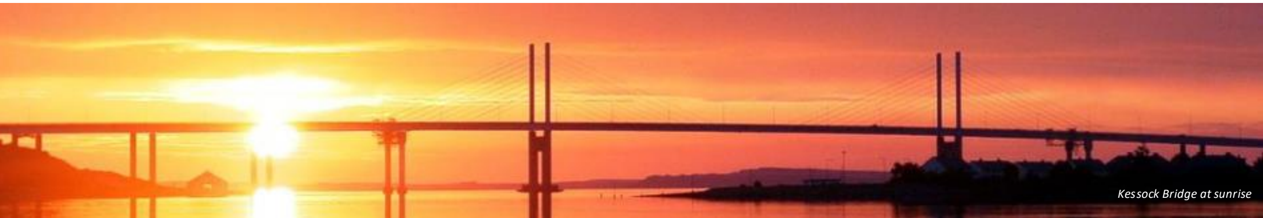
Kessock Bridge at sunrise