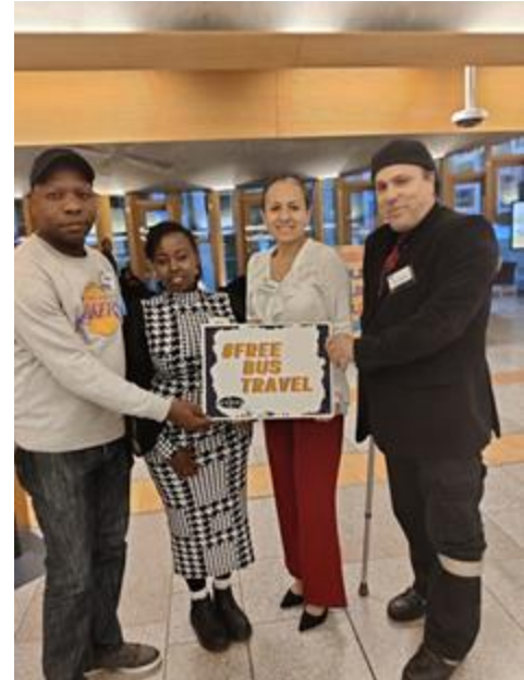
Members from the Voices Network