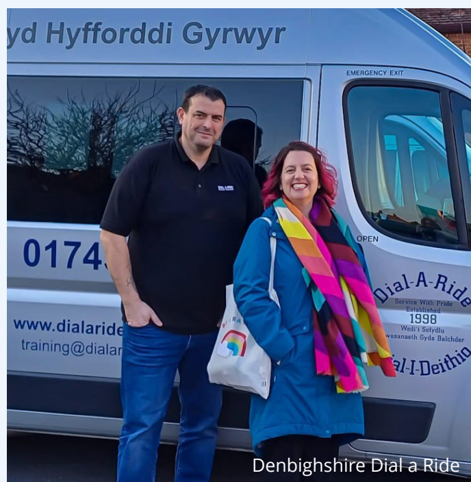
Denbighshire Dial a Ride

Sadly, too many people in Wales are excluded from opportunities, work, education, health, or community because of a lack of accessible transport. A reformed Senedd and a new Welsh Government creates an unparalleled opportunity to craft a new, more equitable transport system that works for all of us, belongs to all of us, and is shaped by all of us, based on fair access for all. We want all political parties to join us in committing to this vision.