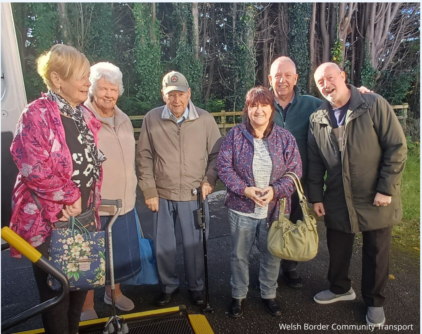
Welsh Border Community Transport