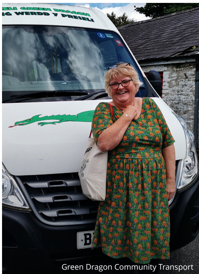
Green Dragon Community Transport