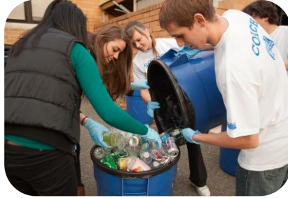
Commitments to sustainability