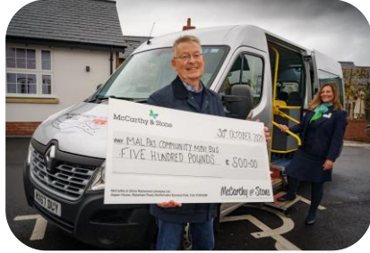
Donations to Community Groups